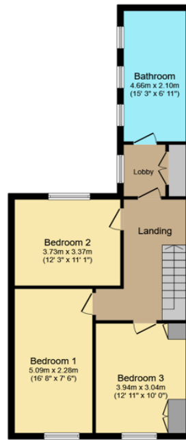
First Floor Floor area 62.1 m 2 (668 sq.ft.)