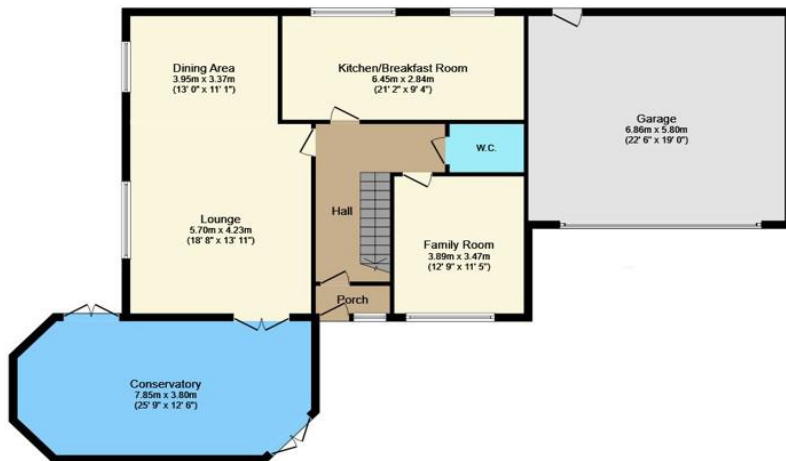
Ground Floor Floor area 157.7 sq.m. (1,698 sq.ft.)