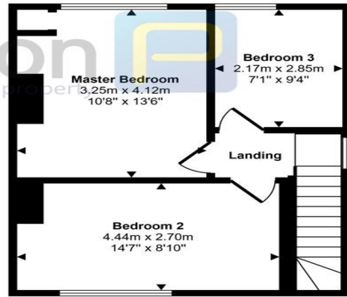
First Floor Approx 38 sq m / 410 sq ft

This floorplan is only for illustrative purposes and is not to scale. Measurements of rooms, doors, windows, and any items are approximate and no responsibility is taken for any error, omission or mis-statement. Icons of items such as bathroom suites are representations only and may not look like the real items. Made with Made Snappy 360.