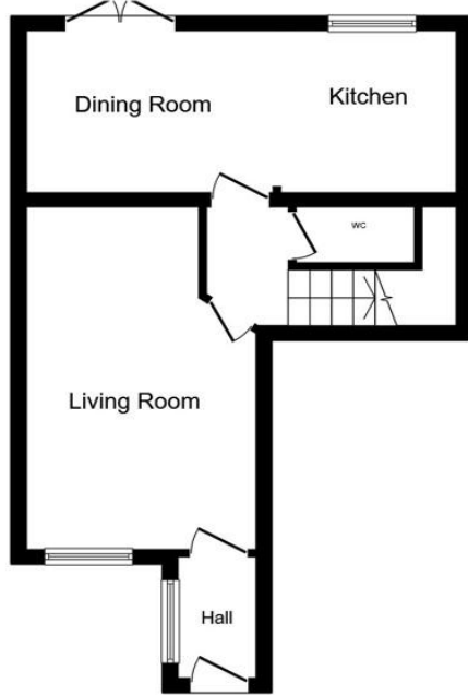
Ground Floor Floor area 36.3 sq.m. (390 sq.ft.)