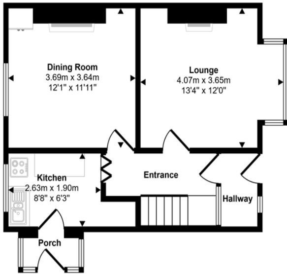
Ground Floor Approx 44 sq m / 476 sq ft

Approx Gross Internal Area 86 sq m / 926 sq ft